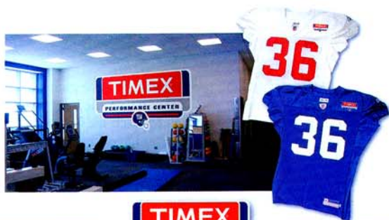
TRAINING ROOM | PRACTICE JERSEY